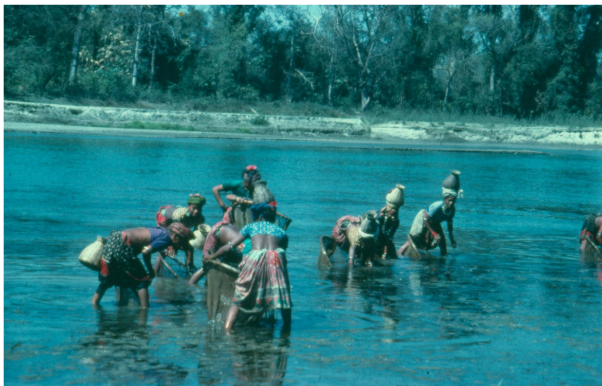
Tharu women fishing in the Chitwan area of Nepal. Ramsar Criteria 7 and 8 recognize the importance of wetlands as fish habitats.

be reached, but 10% is a practical figure for worldwide application. In areas with no endemic fish species, the endemism of genetically-distinct infraspecific categories, such as geographical races, should be used.