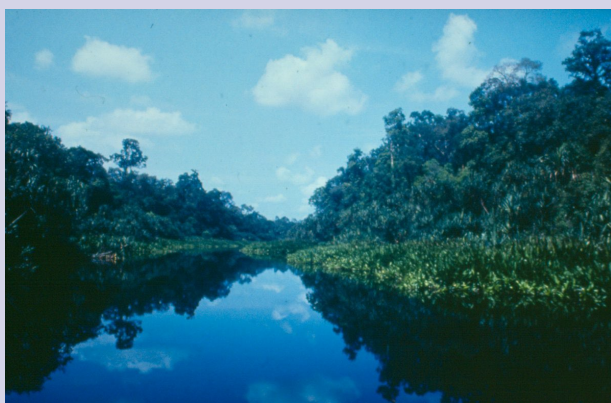
Berbak National Park and Ramsar site in Indonesia - a 160,000-hectare, largely undisturbed peat swamp forest where a full wetland inventory has been carried out.

Action 6.1.3 of the Ramsar Convention Strategic Plan adopted at the 6th COP in Brisbane, Australia, in 1996, sought to encourage the use of regional wetland directories, national scientific inventories and other sources to begin to quantify the global wetland resource. This would be used as a baseline for monitoring trends in wetland conservation and loss. In response, the Ramsar Convention Bureau, with funds provided by the UK, engaged Wetlands International to prepare a Global review of wetland resources and priorities for wetland inventory for the Convention's COP7 and a summary of this review was tabled at the meeting as COP7 DOC. 19.3. This document is available from the Secretariat's web site at http://ramsar.org/cop7_docs_index.htm .