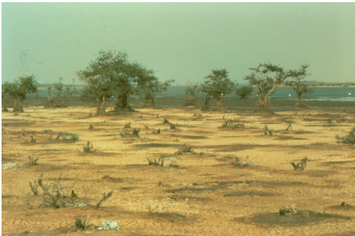
The Ramsar Convention discourages policies, laws, and attitudes that allow unsustainable actions such as this: the aftermath of mangrove destruction.