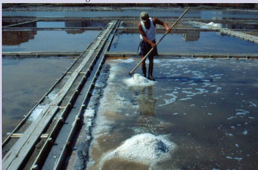
A traditionally managed saltpan in the Pomorie Ramsar site in Bulgaria.

artificial wetlands - increasingly important with reservoirs, dams, salinas, paddy, and aquaculture ponds important in many regions, notably Asia, Africa and the Neotropics, where they can provide habitat for wildlife, particularly migratory birds. Under some circumstances they provide many values and benefits to humans and can partially compensate for the loss and degradation of natural wetlands."