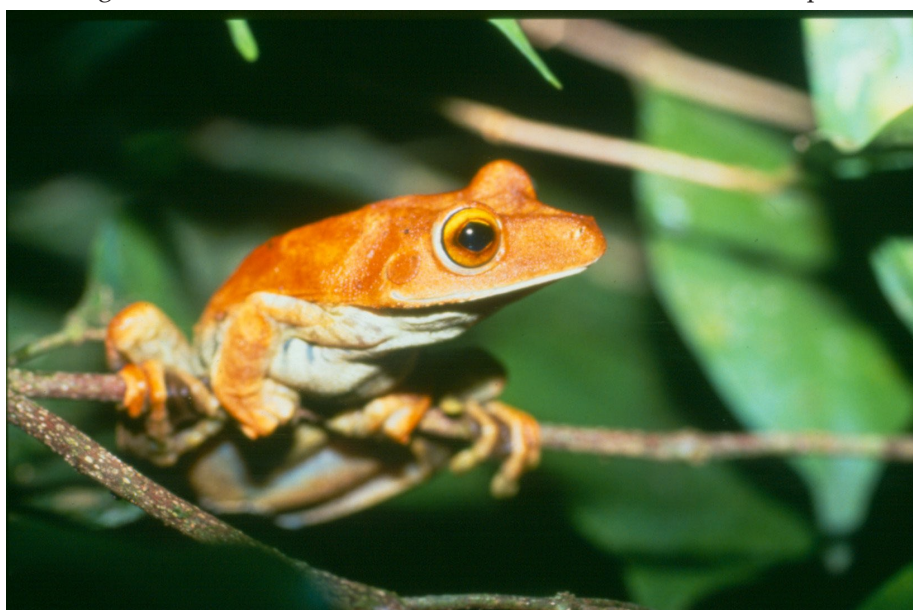
The Ramsar List is intended to recognize the important habitats of vulnerable, endangered and critically endangered species; this is vital, for example, for the world's declining frog populations, as this Hyla rainette in French Guyana.