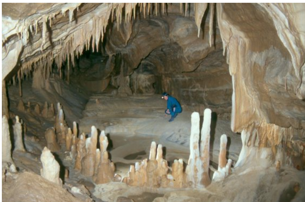
The Grotte des Émotions in Belgium, added to the Ramsar List in 2004.

and indirect, including pollution of all kinds (particularly water pollution; dumping of solid waste, sewage; development of infrastructure, etc.), water abstraction, retention in reservoirs and other uses.