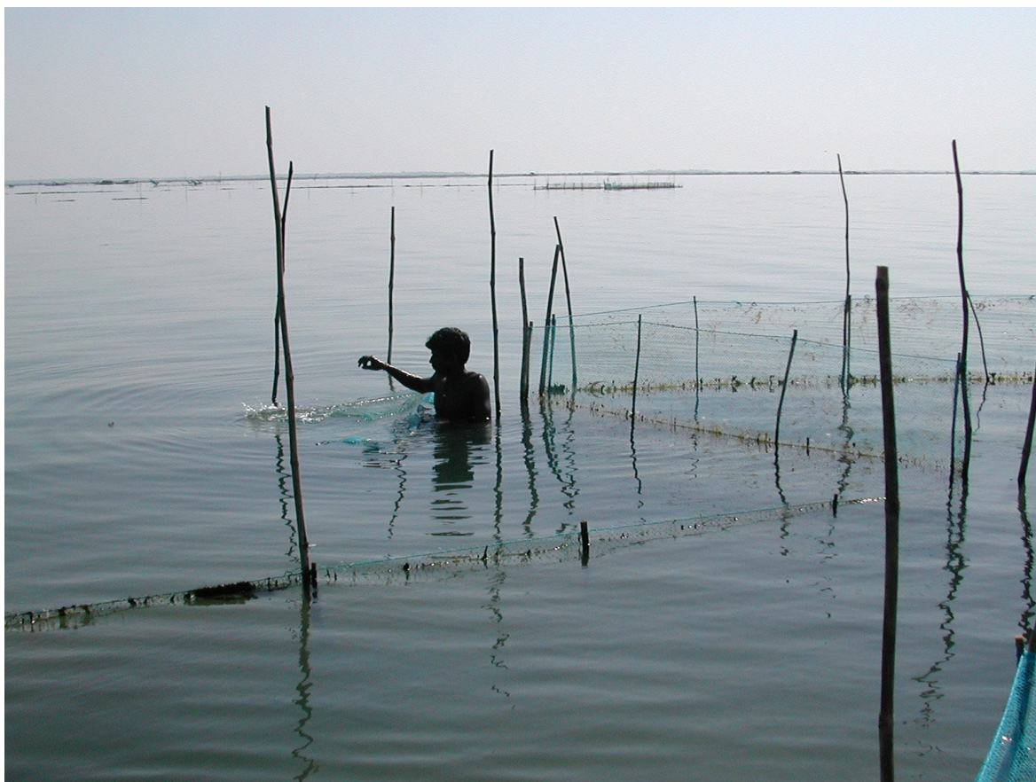
Fisherman and nets, Chilika Lake Ramsar site, India.