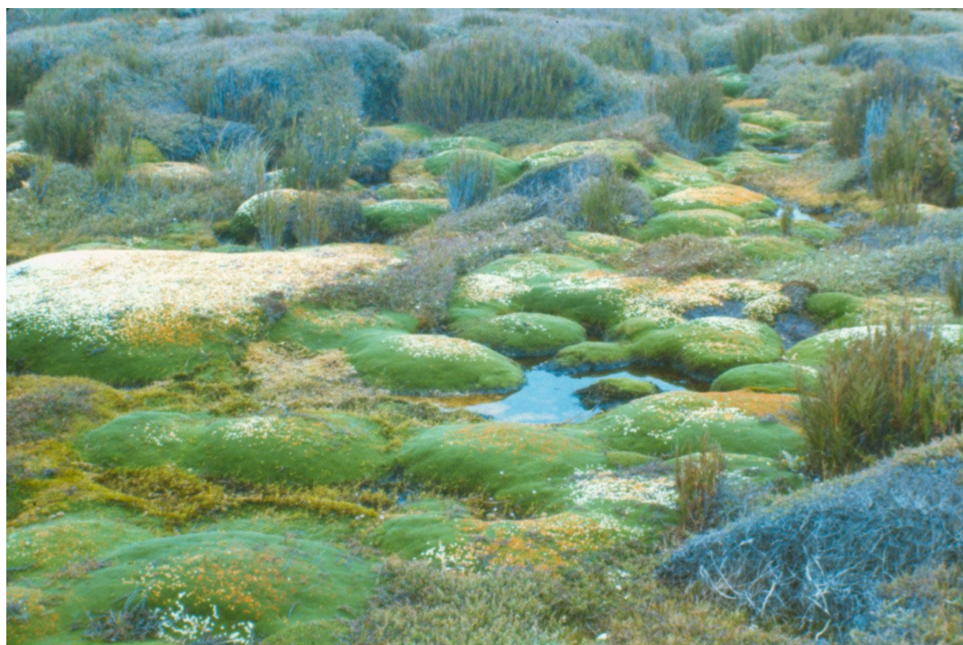
Peatbogs, such as this one in New Zealand, are among the wetland types that are poorly represented in the List of Wetlands of International Importance.

All decisions of the Ramsar COPs are available from the Convention's Web site at http://www.ramsar.org/index_key_docs.htm#res . Background documents referred to in these handbooks are available at http://www.ramsar.org/cop7/cop7_docs_index.htm , http://www.ramsar.org/cop8/cop8_docs_index_e.htm , and http://www.ramsar.org/cop9/cop9_docs_index_e.htm .