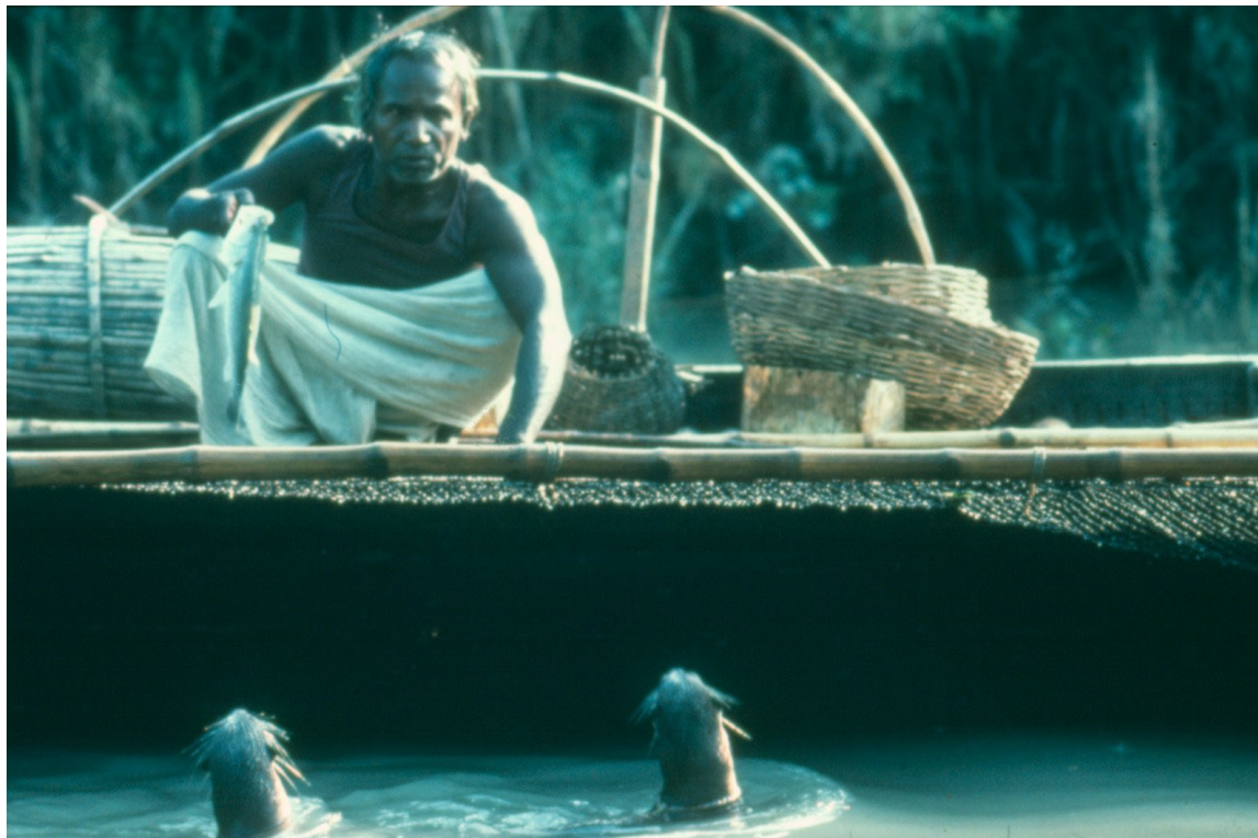
In Bangladesh, the Sundarbans mangrove forest is both a World Heritage and a Ramsar site. Parties to the Ramsar Convention are urged to ensure that all of their internationally important wetlands are Ramsar-listed in addition to the recognition of these sites under other instruments. Above: a fisherman with his trained otters.